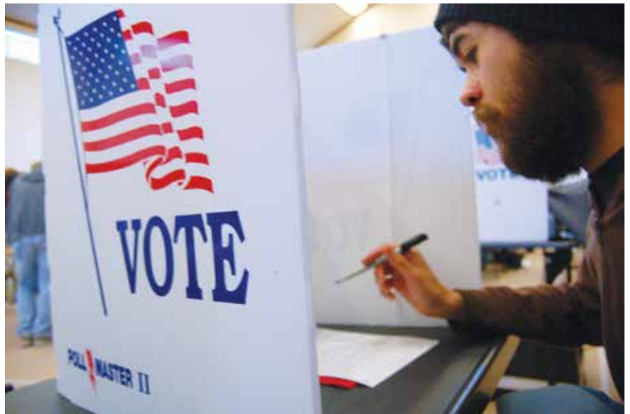
Voting booth in Atascadero, California, in 2008.

Voting in an election and contacting our elected officials are two ways that Americans can participate in their democracy.