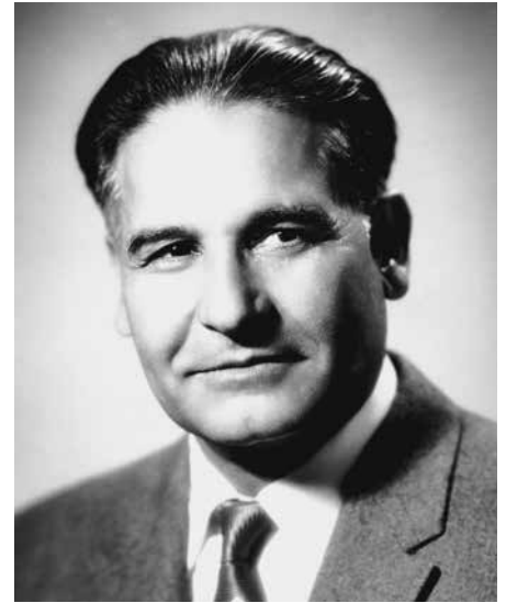
U.S. Representative Dalip Singh Saund was born in India. He served in Congress from 1957 to 1962.

Courtesy of the Library of Congress, LC-USZ62-102603