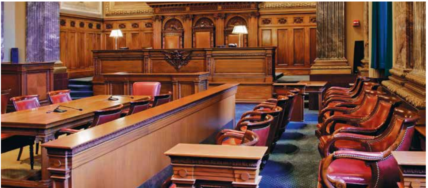
The jury box in the Howard M. Metzenbaum U.S. Courthouse, Cleveland, Ohio.

Courtesy of the Library of Congress, LC-USZ62-102603