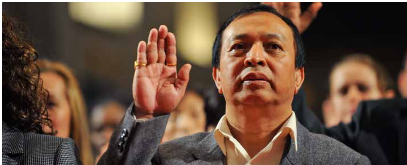
Taking the Oath of Allegiance at a naturalization ceremony in Washington, D.C.

The process required to become a citizen is called naturalization.