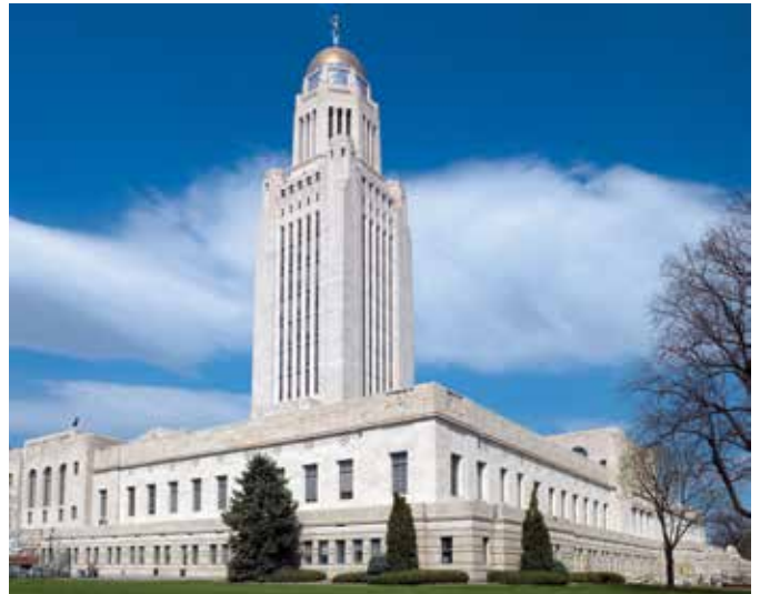
State Capitol building in Lincoln, Nebraska. Courtesy of the Library of Congress, LC-DIG-highsmith-04814.