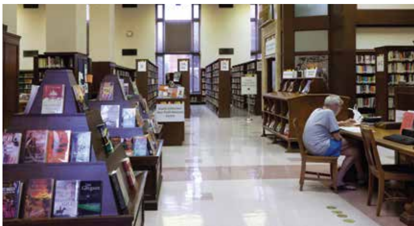
The Enoch Pratt Free Library in Baltimore, Maryland

This activity may take a few minutes but doing it is a valuable step in breaking the ice. It benefits everyone in several ways: