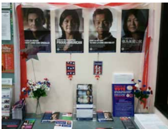
Echo Park Library’s Citizenship Corner, Los Angeles, California