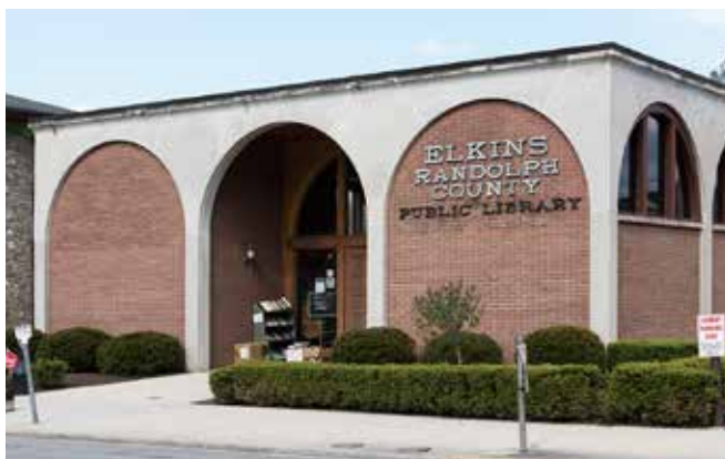
The Elkins Randolph County Public Library, Elkins, West Virginia LC-DIG-highsm-31631.