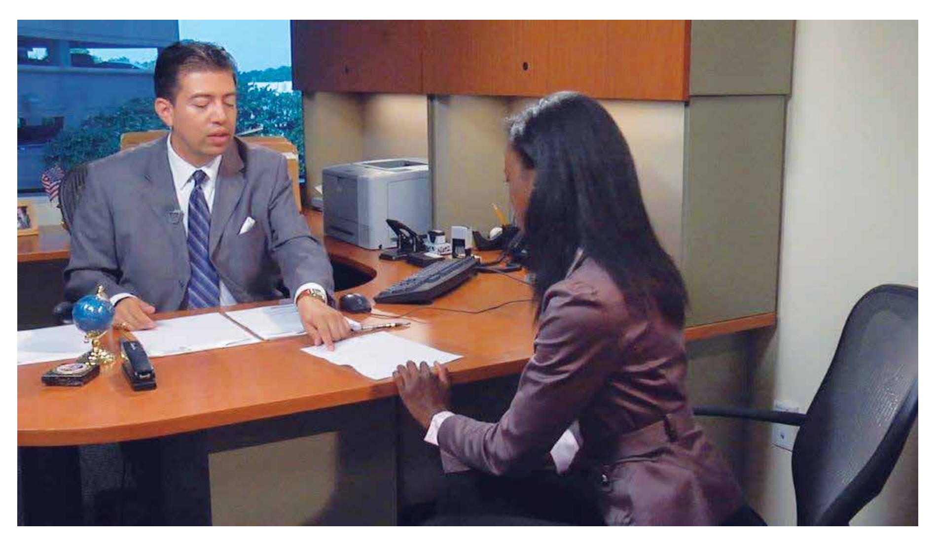
Dialogue 5, "Taking the Reading and Writing Tests"