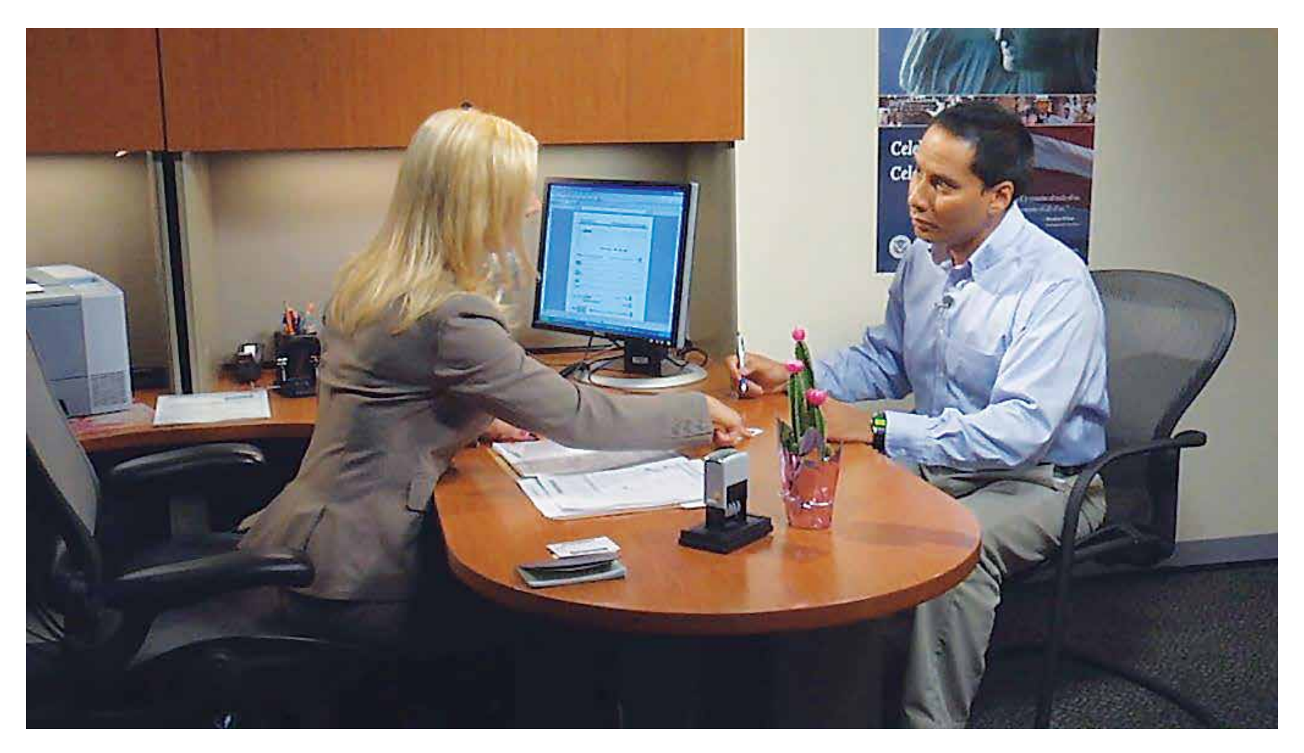
Dialogue 3, "Following Instructions"