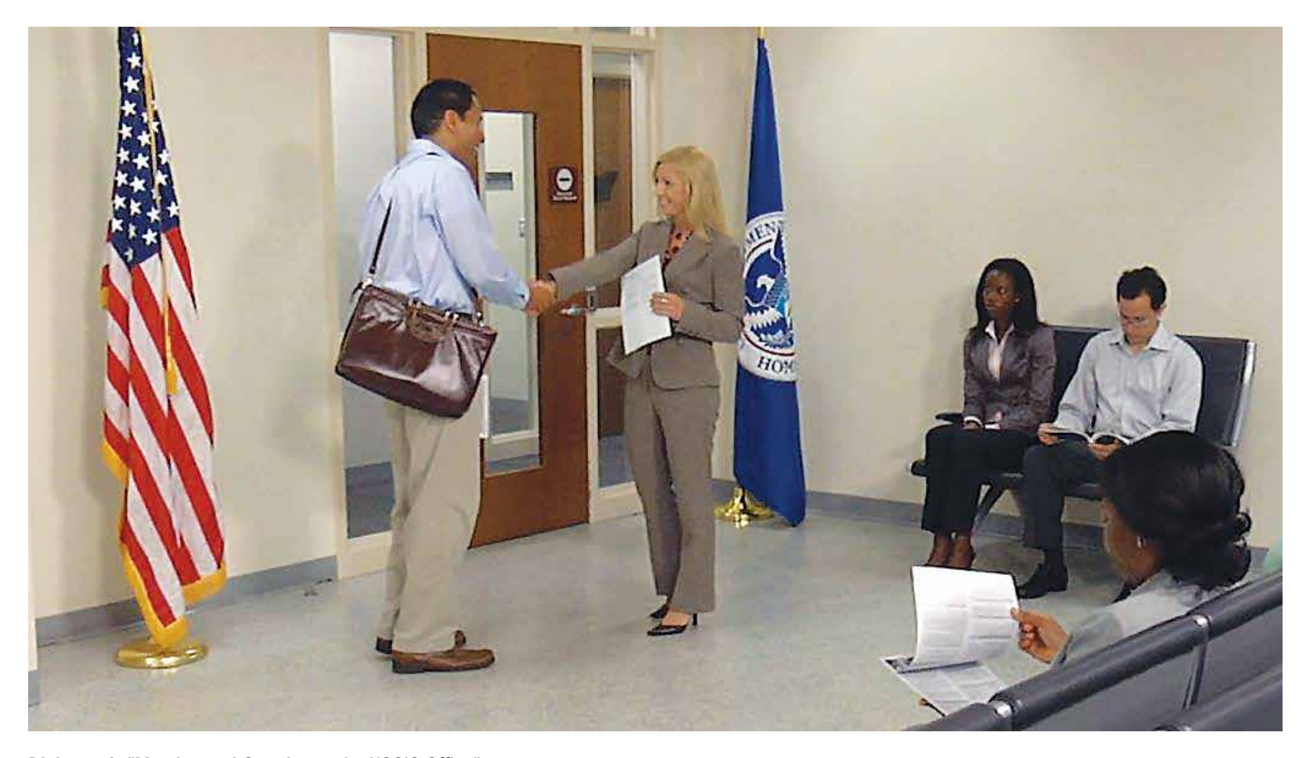
Dialogue 1, "Meeting and Greeting at the USCIS Office" \,