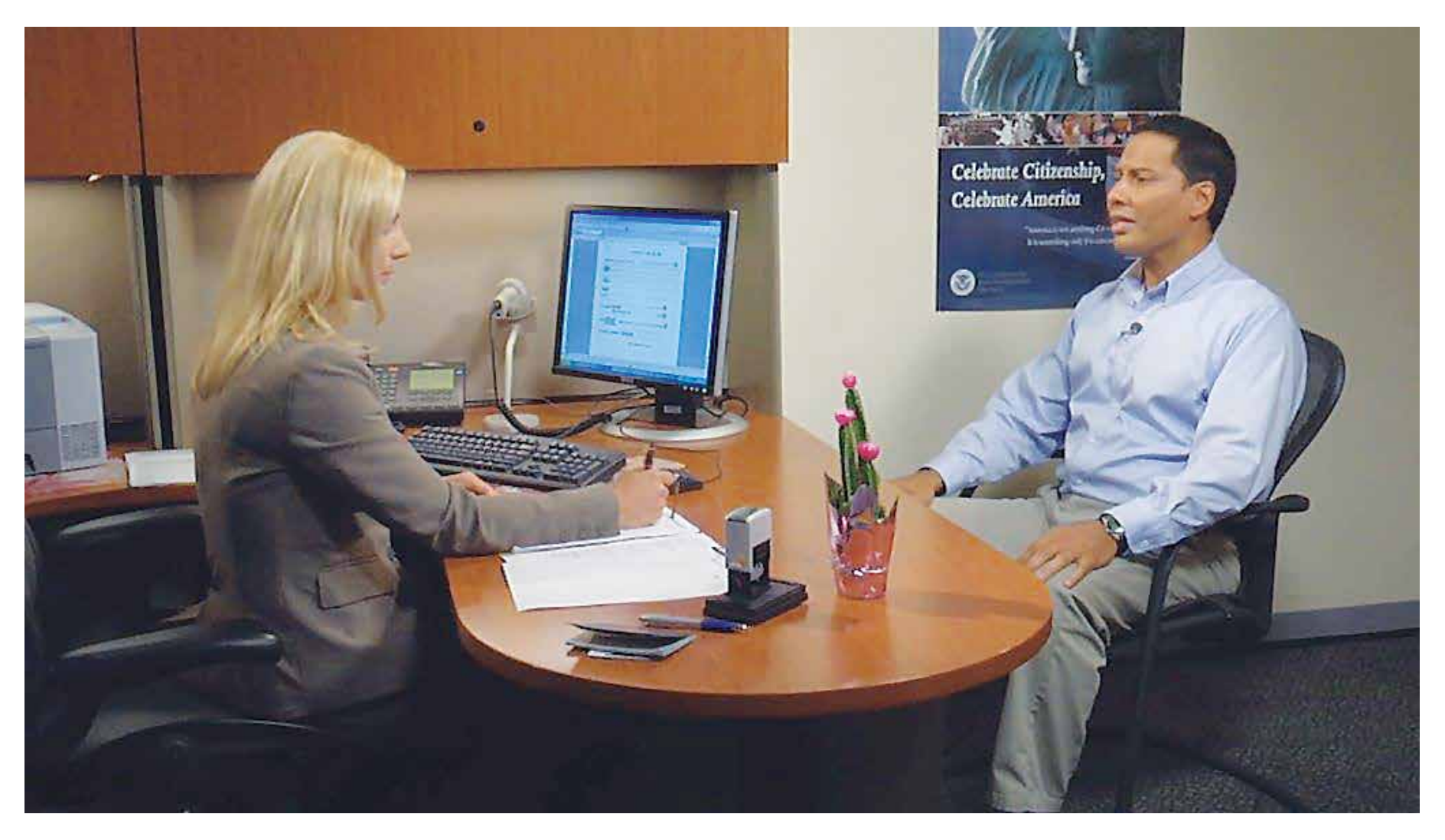
Dialogue 2, "Answering Questions from Form N-400, Application for Naturalization"