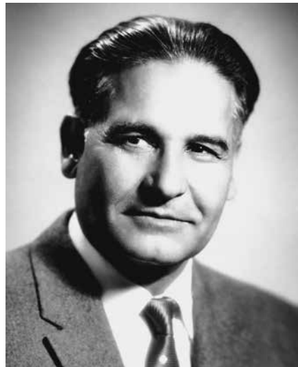
U.S. Representative Dalip Singh Saund was born in India. He served in Congress from 1957 to 1962.

have been elected as U.S. Senators and U.S. Representatives. In order to run for the Senate, a candidate must have been a U.S. citizen for at least 9 years. To run for the House of Representatives, a candidate must have been a U.S. citizen for at least 7 years. To run for president of the United States, a candidate must be a natural born (not naturalized) citizen.