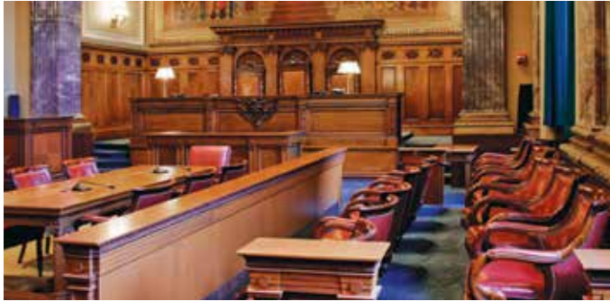
The jury box in the Howard M. Metzenbaum U.S. Courthouse, Cleveland, Ohio.

There are two important responsibilities that are only for U.S. citizens: to vote in federal elections and to serve on a jury. A jury is a group of citizens in a courtroom that listens to a trial. The jury decides the outcome of a trial. If a citizen gets a court letter to serve on a jury, the person must go. Another responsibility of citizens is voting. The law does not require citizens to vote, but voting is a very important part of any democracy. By voting, citizens are participating in the democratic process. Citizens vote for leaders to represent them and their ideas, and the leaders support the citizens' interests.