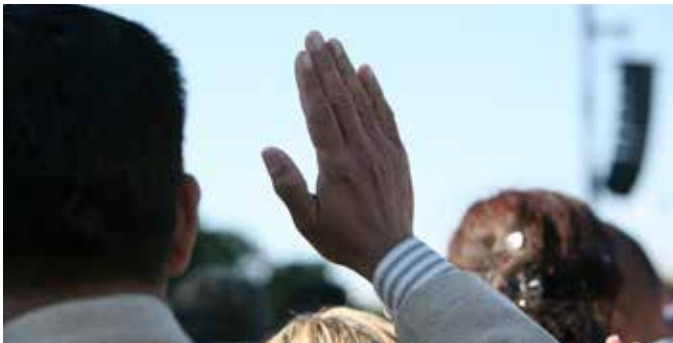
Taking the Oath of Allegiance at a naturalization ceremony in Washington, D.C.

In order to become a U.S. citizen, you must successfully complete the naturalization process. First, you must be eligible to apply for citizenship. There are important requirements to meet in order to apply. For example, you must be a permanent resident who has lived in the United States for a specific period of time. You must also have good moral character, and understand and support the Constitution.