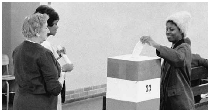
Young woman voting in 1964.

vote on issues. Voters may want to make changes to their community, such as building bigger schools or adding new roads. We can contact our government officials when we want to support or change a law. Voting in an election and contacting our elected officials are two ways that Americans can participate in our democracy.