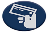
Click to Pay the USCIS Immigrant Fee

Please choose the appropriate icon to file a Form I-90, or pay the USCIS Immigrant Fee or Form I-131A application fee.