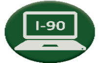
Click to File the Form I-90 Online

To update your U.S. mailing address, please visit www.uscis.gov/addresschange .