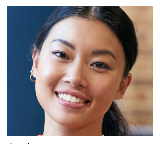
Graduates From high school to advanced degrees in a range of fields: