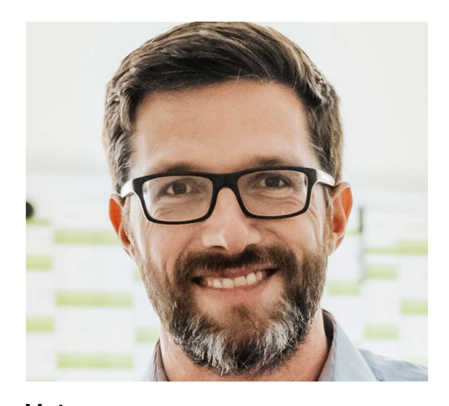
Veterans From every branch of our armed forces

<u>Learn more about</u> <u>special hiring programs</u>