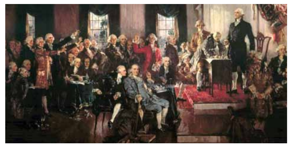
Scene at the Signing of the Constitution by Howard Chandler Christy.