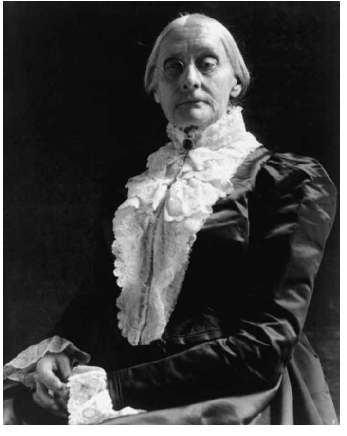
Susan B. Anthony