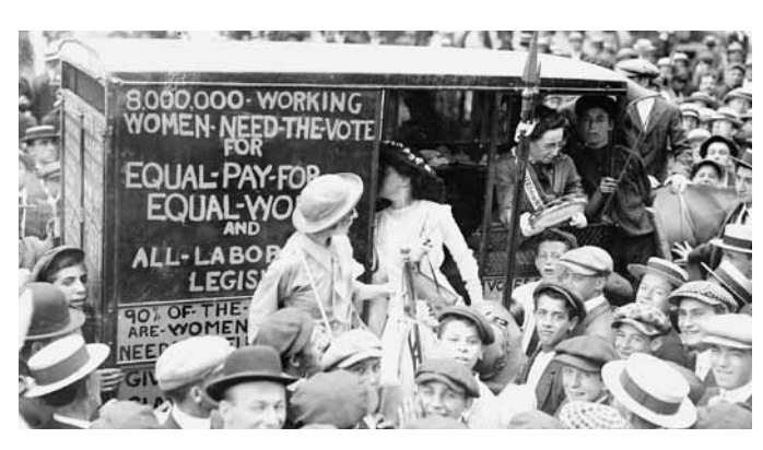
Women on their way from New York to Boston in 1914.