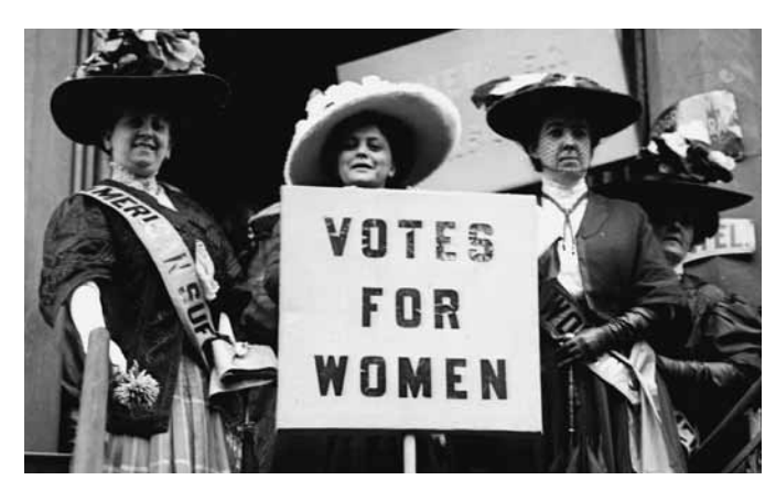
Women demonstrating in New York in 1908. Courtesy of the Library of Congress, LC-DIG-ggbain-02466.