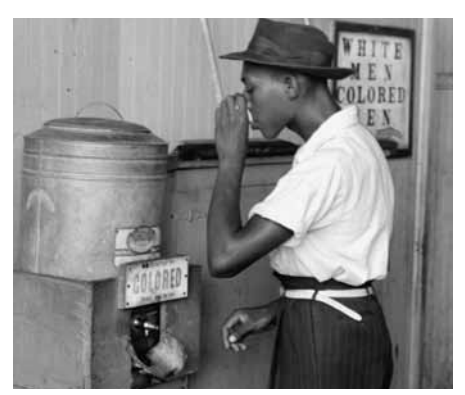
An African American man drinking at a colored water cooler in Oklahoma City, OK, 1939.

Until 1920, women were not allowed to vote in political elections. This image shows two women petitioning for the right to vote (ca. 1917) in New York State.