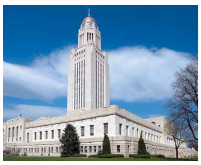
State Capitol building in Lincoln, Nebraska.