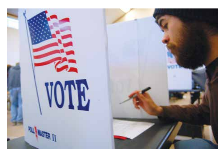
Voting booth in Atascadero, California, in 2008.

Voting in an election and contacting our elected officials are two ways that Americans can participate in their democracy.