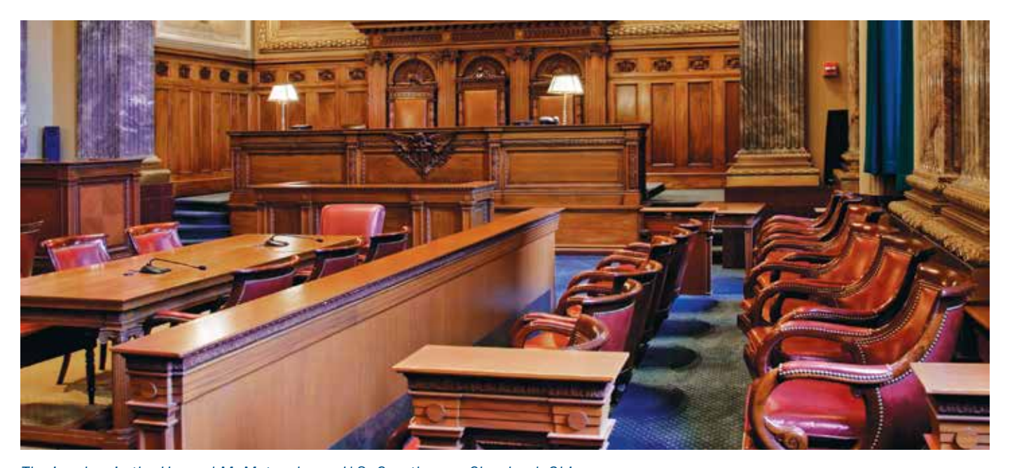
The jury box in the Howard M. Metzenbaum U.S. Courthouse, Cleveland, Ohio.