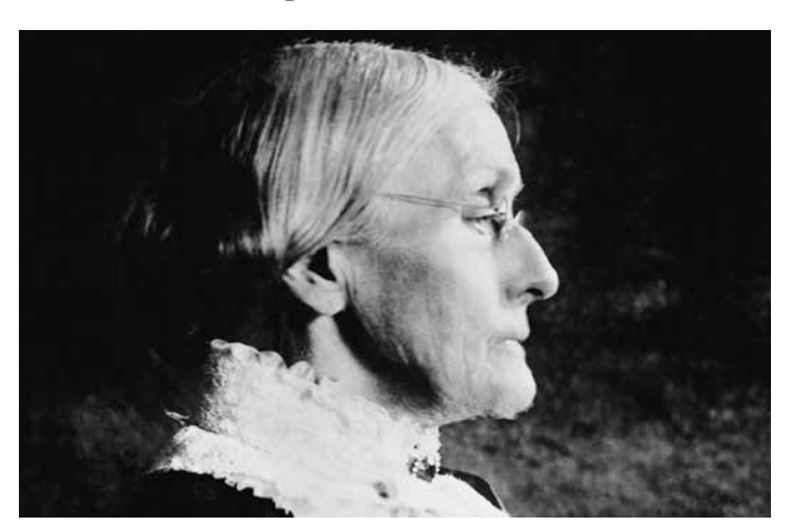
Susan B. Anthony

She died in 1906, 14 years before the 19th Amendment was passed. The 19th Amendment