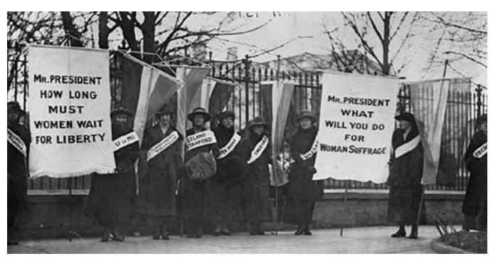
Until 1920, women were not allowed to vote in political elections. This image shows women, known as suffragettes, petitioning for the right to vote in Washington, D.C., February 1917.

In addition to freedom of religion, the First Amendment guarantees freedom of speech, press, and peaceful assembly, and the right to petition the government for change. Famous and ordinary people in America have exercised those freedoms in their fight for equality. We remember Susan B. Anthony and Martin Luther King, Jr. for their fight for civil rights.