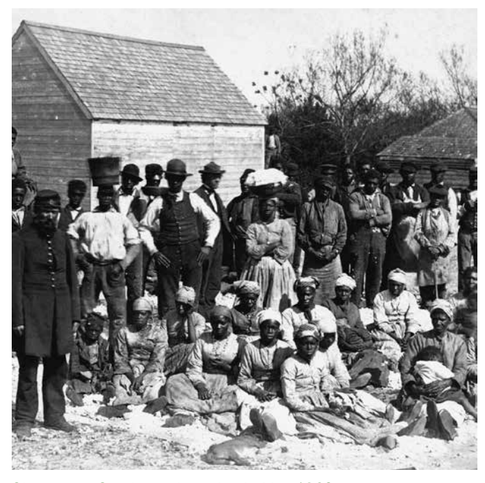
Slaves on a Southern plantation in May 1862. Courtesy of the Library of Congress, LC-DIG-ppmsca-04324.

When the Civil War ended in 1865, the 13th Amendment to the Constitution was passed. This amendment freed all slaves in every state. In 1868, the 14th Amendment was passed and all black people became U.S. citizens. Later in 1870, the 15th Amendment gave voting rights to all black men. These changes were important in the fight for freedom for African Americans. However, this was only the beginning of many