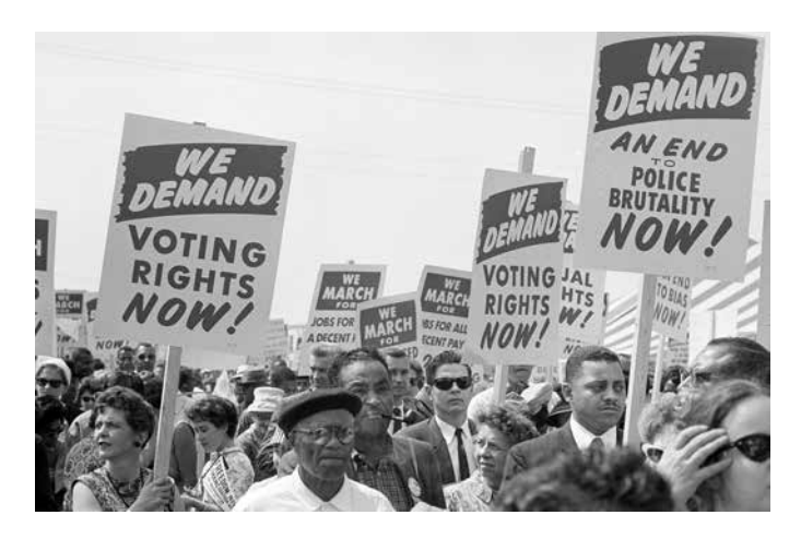
The March on Washington in 1963. Courtesy of the Library of Congress, LC-DIG-ppmsa-37229.