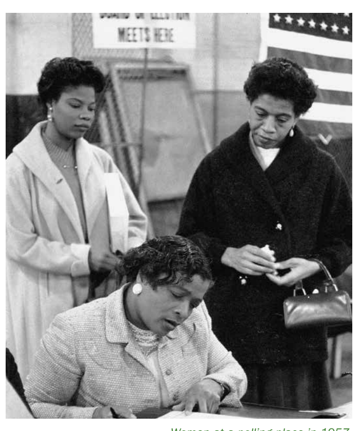
Women at a polling place in 1957. Courtesy of the Library of Congress, LC-DIG-ds-08063.

to the Constitution gave women the right to vote in 1920. In 1979, a one-dollar coin with her face was created to honor her contribution to civil rights and women's rights. It is called the Susan B. Anthony dollar.