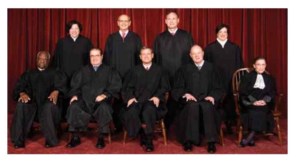
The Supreme Court Justices in 2010.