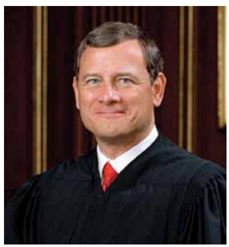
Chief Justice John G. Roberts, Jr.