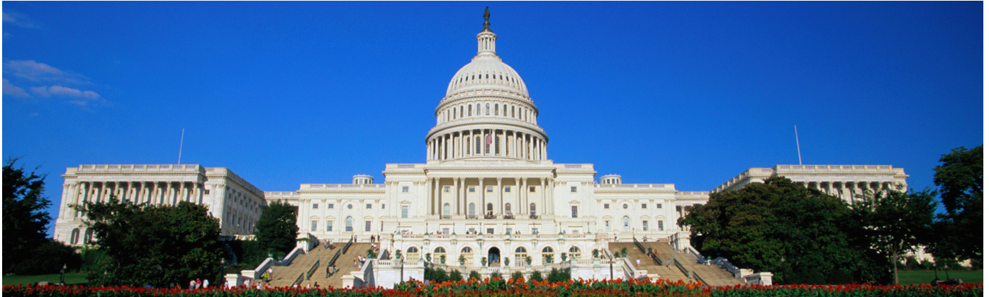
The Capitol Building

The legislative branch of the U.S. government is called Congress. Congress has two parts, the Senate and the House of Representatives. Congress meets in the U.S. Capitol building in Washington, DC.