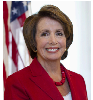
Nancy Pelosi, Speaker of the U.S. House of Representatives.

The top official is called the Speaker of the House of Representatives. If the President and Vice President can no longer serve, the Speaker of the House of Representatives becomes President. The current Speaker of the House is Nancy Pelosi.