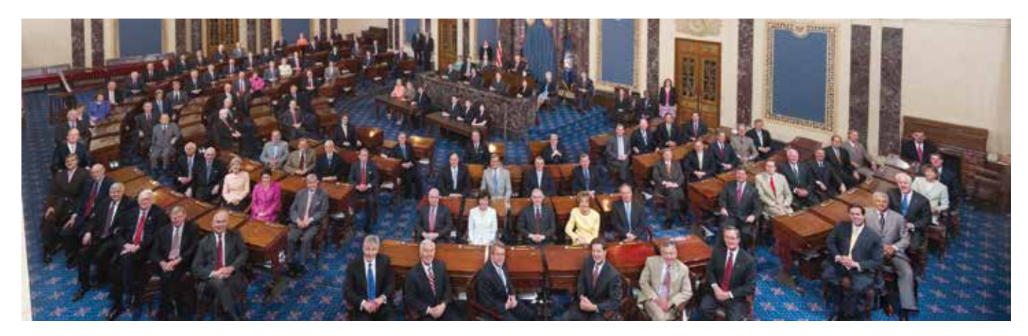
The Senators of the 109th Congress.