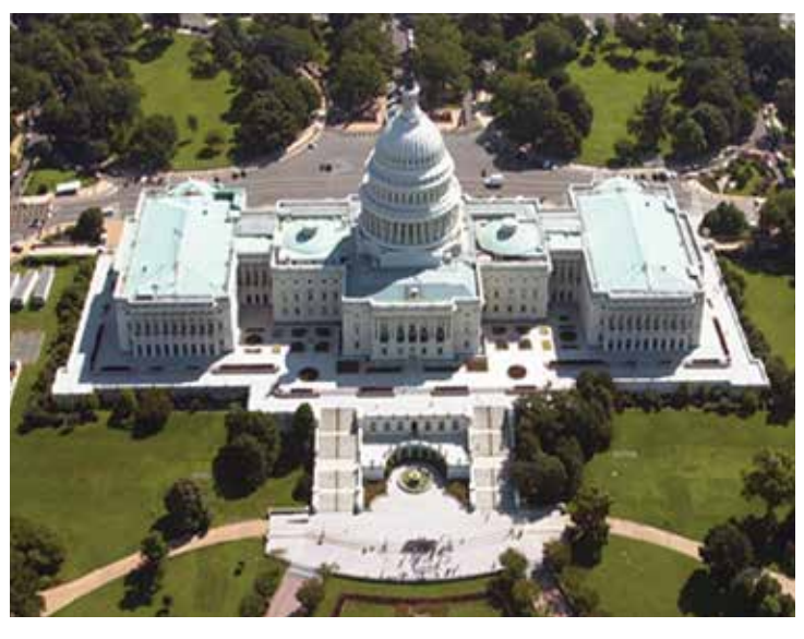
Aerial view of the west front of the U.S. Capitol in Washington, D.C.