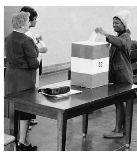
A young woman casting her ballot in the 1964 presidential election. Courtesy of the Library of Congress, LC-DIG-ppmsca-04300.