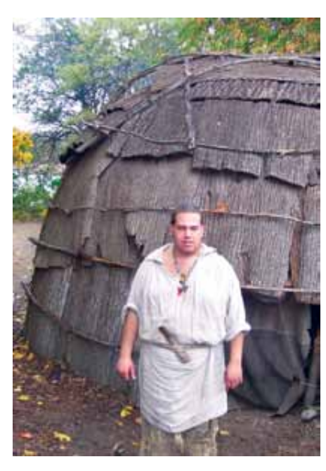
A recreation of a Wampanoag roundhouse at the Plimoth Plantation Museum in Plymouth, MA.

They planted pu_____, co____, be____, mel____, sun____, and squ____.