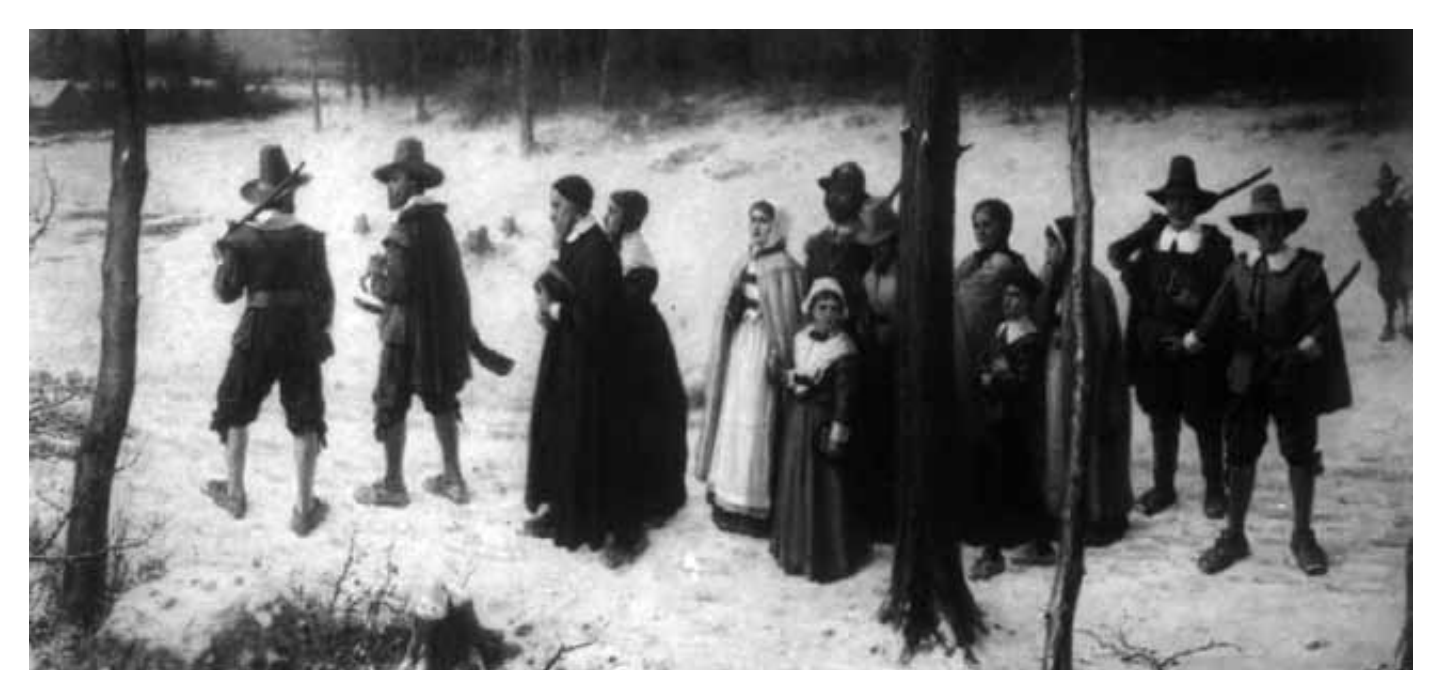
"Pilgrims Go to Church" by George Henry Boughton. Courtesy of the Library of Congress, LC-USZ62-3291.

In November 1620, the Pilgrims arrived in North America.