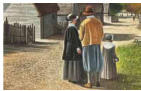
"O Beautiful for Pilgrim's Feet" Illustration © 2003 by Wendell Minor, from the book "America the Beautiful." GP Putnam's Sons.