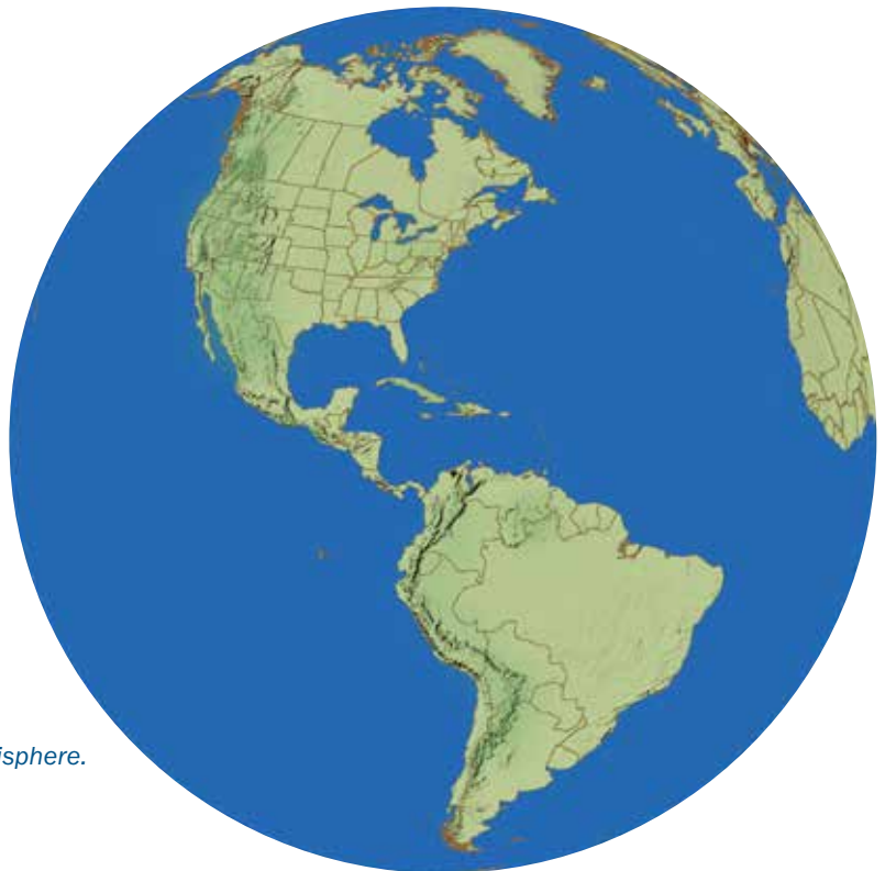
The Western Hemisphere.

Label your state and your state capital.