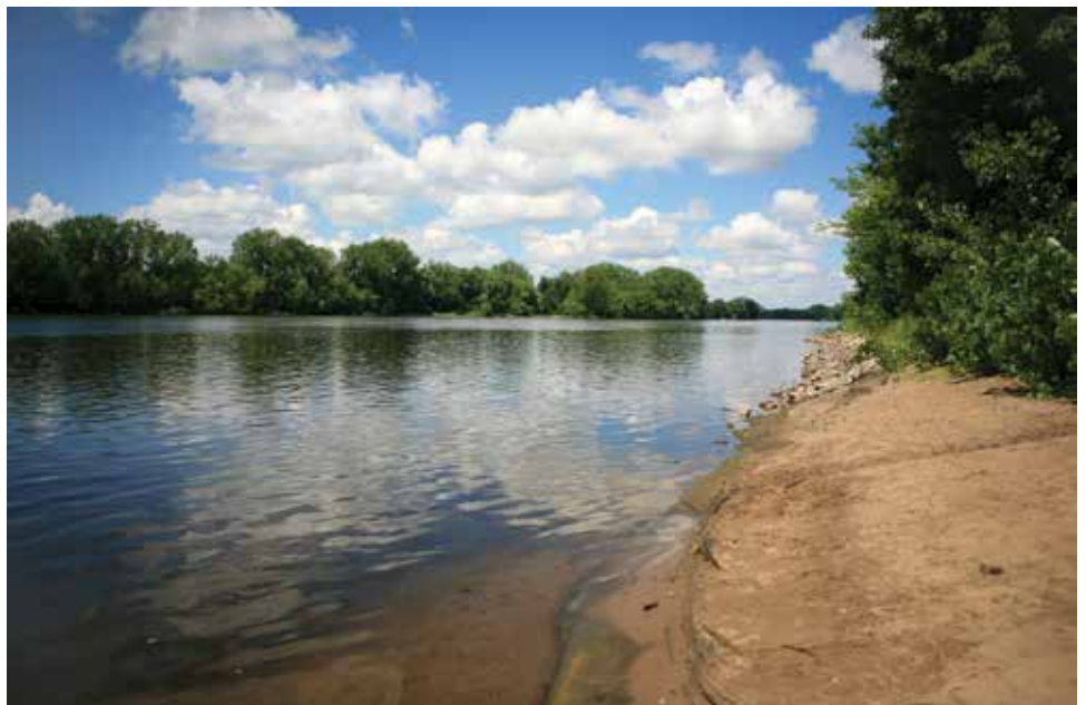
The Mississippi River.