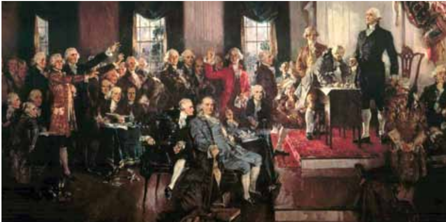
Scene at the Signing of the Constitution by Howard Chandler Christy.