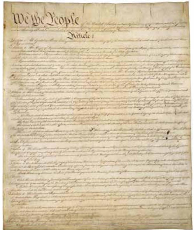
The Constitution of the United States.