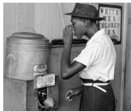
An African American man drinking at a colored water cooler in Oklahoma City, OK, 1939.