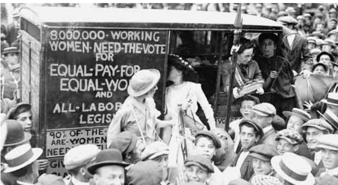
Women on their way from New York to Boston in 1914. Courtesy of the Library of Congress, LC-DIG-ggbain-13711.