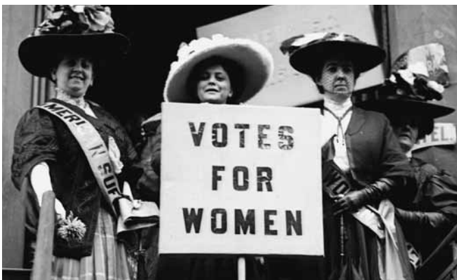
Women demonstrating in New York in 1908. Courtesy of the Library of Congress, LC-DIG-ggbain-02466.