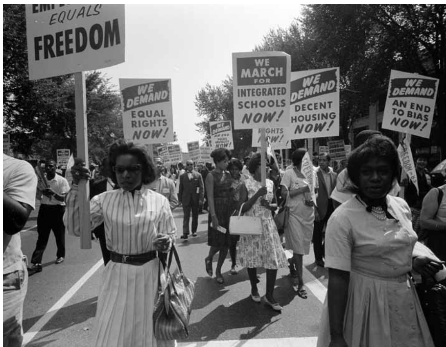
Demonstrators at the March on Washington for Jobs and Freedom in Washington, D.C., August 28, 1963.

Every January, we remember him on Martin Luther King, Jr. Day.