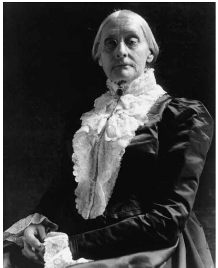
Susan B. Anthony