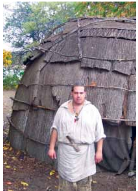
A recreation of a Wampanoag roundhouse at the Plimoth Plantation Museum in Plymouth, MA.

They planted pu_____, co_____, be_____, mel_____, sun_____, and squ_____.