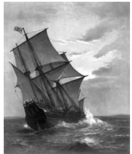
The Mayflower Approaching Land. Courtesy of the Library of Congress, LC-USZ62-3046.