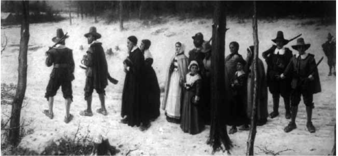
"Pilgrims Go to Church" by George Henry Boughton.

In November 1620, the Pilgrims arrived in North America.