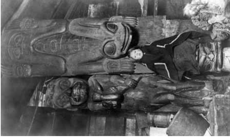
Old totem poles in chief's house in 1895 in Alaska.