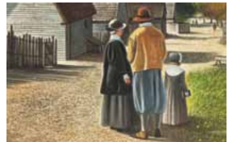
"O Beautiful for Pilgrim's Feet" Illustration © 2003 by Wendell Minor, from the book "America the Beautiful." GP Putnam's Sons.