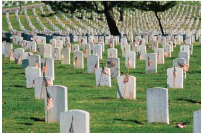
Arlington National Cemetery.