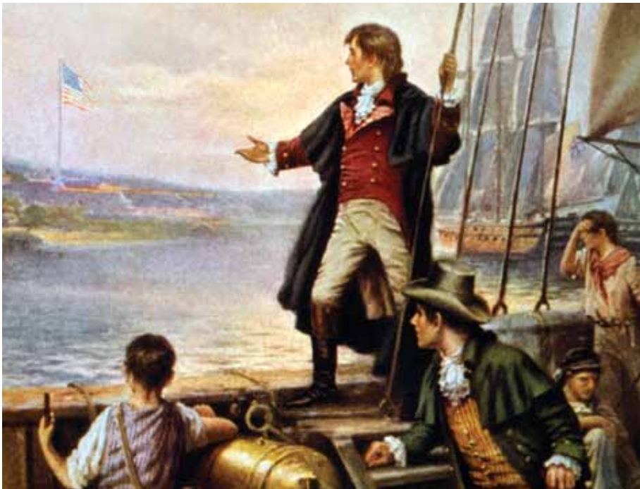
In "The Star-Spangled Banner," by Percy Moran, Francis Scott Key points at the flag flying over Fort M'Henry.

The national anthem is called “The Star-Spangled Banner.”